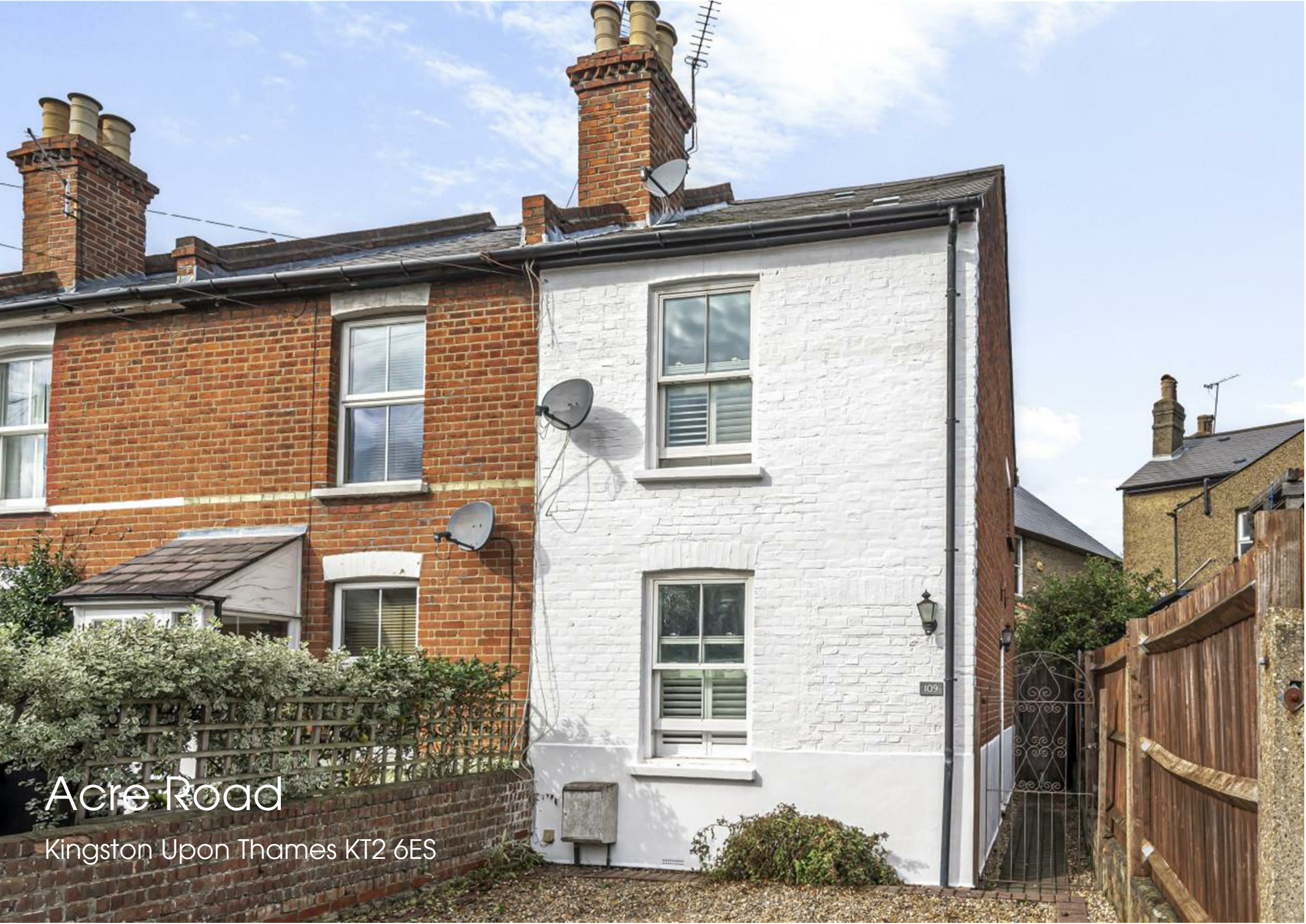
Acre Road Kingston Upon Thames KT2 6ES